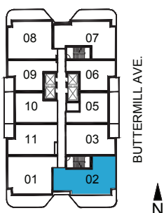
Level 5-42 TOWER A